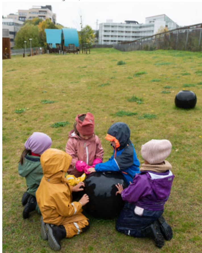
Skullerudbakken kindergarten, Oslo