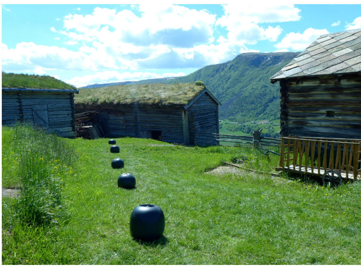
Budsjord at Dovre